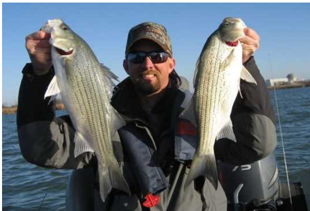
Winter time fishing at Coffey County Lake

All articles are copyright of Kansas Department of Wildlife & Parks and cannot be copied or distributed without permission from KDWP.