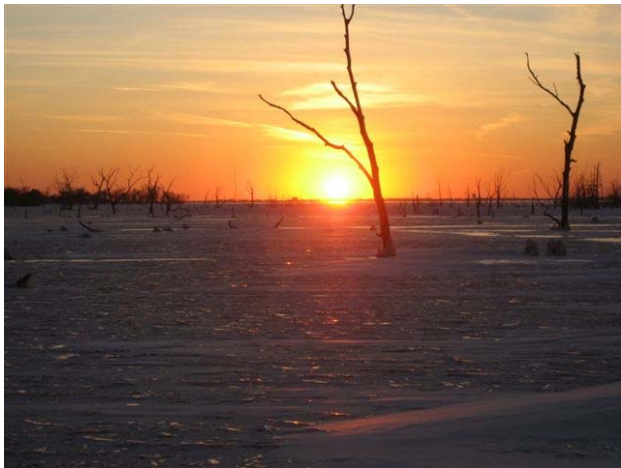
Sunset over frozen El Dorado Reservoir January 2010