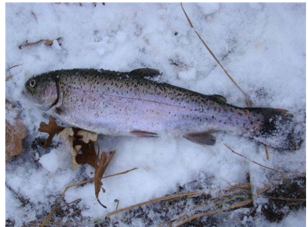
Rainbow trout provide great wintertime fishing at El Dorado

I've had anglers look at me like I'm crazy when I asked them if they have been trout fishing at El Dorado. "Trout? There aren't any trout around here," they say. But the trout are there and lots of 'em! Each fall when the water temperatures fall in to the 60s, trout are stocked in the El Dorado Trout Stream which is located in the Walnut River Area of El Dorado State Park.