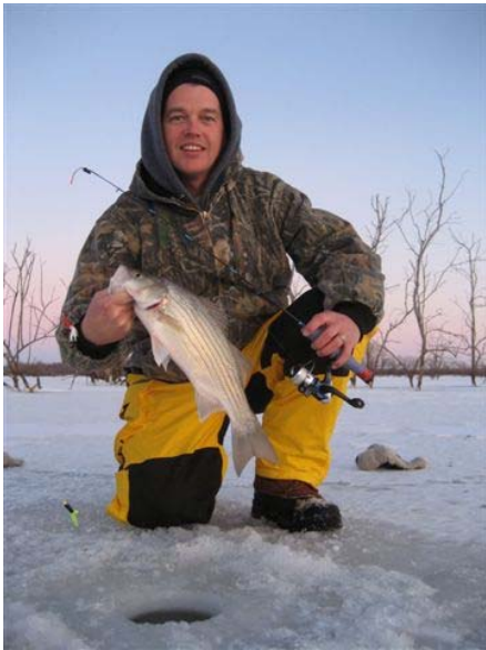
El Dorado Reservoir ice angler with wiper