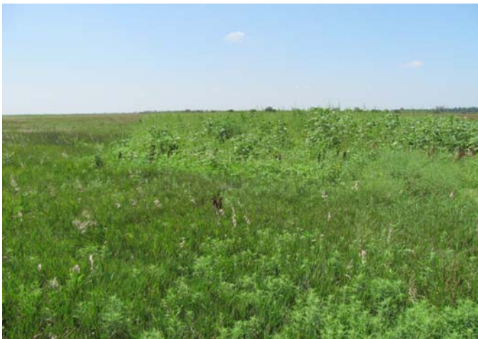
Disked strip in brome CRP

This spring, strips were established in the north refuge, brome field around pools 15 and 16, and native grass around pools 1 and 2. All of these are located in the Big Basin unit. These strips look very good and have blossomed just as planned. Besides providing brood-rearing habitat, they will provide a little extra food resources for all wildlife with the production of seeds from these annual plant communities.