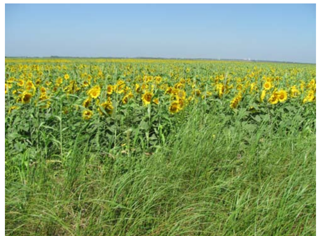
Farland Lake sunflower / dove field.

As was provided last year, KDWP will have a dove management field on the farthest east edge of the Farland Lake unit southeast of Inman. This field is approximately 60 acres of sunflowers, of which 25 percent will remain as KDWP's share of the crop. This 25 percent will be mowed in stages prior to the September 1 dove season opener. This field is located one mile north of 11 th Road and Arapahoe. There is an iron ranger on site to collect daily hunting permits. Remember, non-toxic shot must be used for hunting doves.