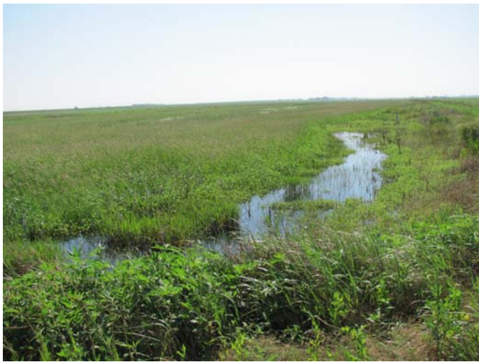
Big Basin pool 4

Remember , drought cycles are a natural part of a prairie wetland system and occur over consecutive years. Realistically, in our part of the world, we should expect to have water three out of five years. In recent years, we have been blessed with water during the fall on a more consistent basis, which has resulted in increased duck populations in the area and more acres of flooded habitat to hunt. This has in a sense, spoiled us duck hunters. Unfortunately, Mother Nature has a huge part in whether these types of prairie wetland systems will produce hunting opportunities and subsequently, ducks. Good moist soil wetland management includes the periodic release of water, usually in the spring, to promote annual native vegetation (duck food – smartweed, barnyard grass, pig weed, foxtail, etc.). Established areas need a disturbance about every three years (disking, chemical application, or water level manipulation) to suppress unwanted perennial vegetation (cattails, spike-rush, and perennial smartweed) which recently has invaded aggressively. These disturbances also stimulate annual plant production. We are nearing a point at McPherson when this needs to be addressed. Water level manipulations have produced excellent moist soil plant responses this year in basically all the pools that we utilized this management tool. These activities take a lot of time and money to complete, so the staff at MPWL wants these pools full and ready for duck season as much as anyone.