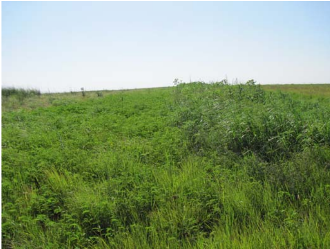
Disked strip in native grass.

financial investment and physical efforts, including chemical application, hand removal, and contracted tree shear work. Even though these perches have been removed, avian depredation is still a concern for small birds. Starting this spring, staff has implemented what will become annual disked strips to disturb grass tracts and stimulate annual plant responses.