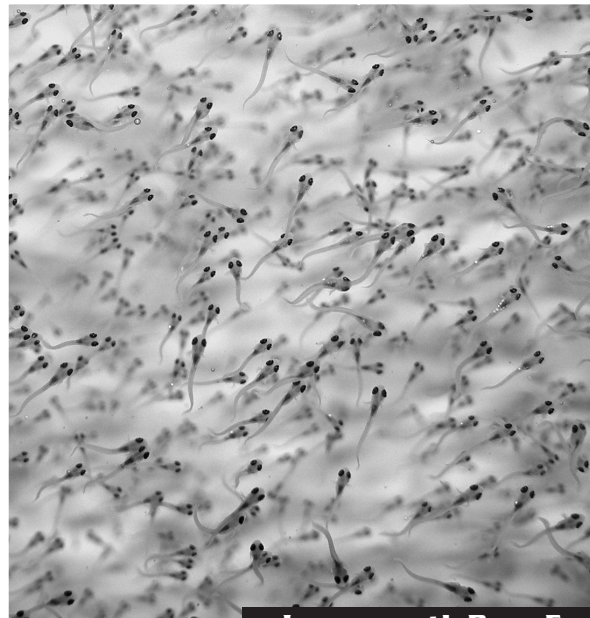
Largemouth Bass Fry

Fish species cultured at the Meade facility in the spring include; largemouth bass, grass carp, and fat-head minnows. In the summer months, intermediate channel catfish, bluegill, and koi carp are also produced. During the winter months some of the culture ponds are used for largemouth bass brood fish, fathead minnows and grass carp.