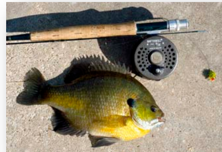
The Bluegill Sunfish ( Lepomis macrochirus )