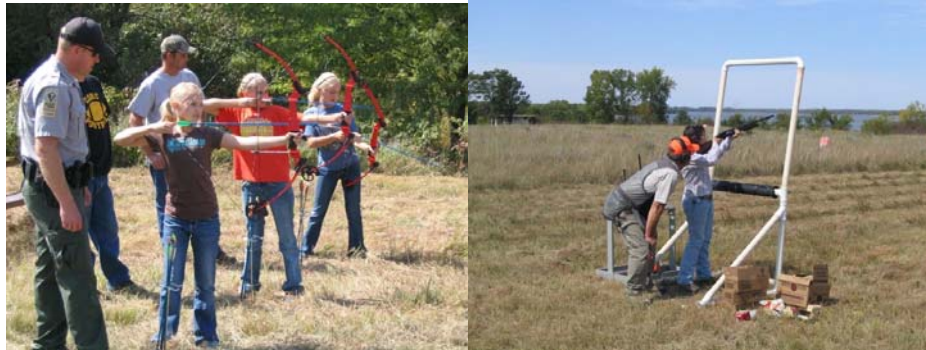
Archery station at annual outdoor youth event. Shotgun station at annual outdoor youth event.

Area youth are invited to attend a FREE shotgun, pellet rifle, and archery shooting and safety clinic on Saturday, September 22 at Council Grove Lake. Sponsored by the Kansas Department of Wildlife, Parks, & Tourism (KDWP), The U.S. Army Corps of Engineers (COE), the Flint Hills Chapter of Quail and Upland Wildlife Federation (QUWF), and Morris County Hunter Education instructors, this special event will provide participants with an opportunity to enhance firearm and archery shooting and safety skills. Controlled live fire instruction will teach safe, responsible, and fun shooting techniques.