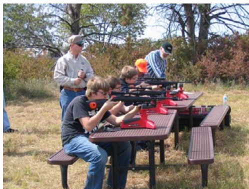
Air rifle station at annual outdoor youth event.

Anyone, age 11 through 16 may participate. Participants are required to pre-register for the event. Students are not required to have completed a hunter education course, but prior completion is preferred. The event will begin at 12:00 p.m. at the COE managed area between Marina Cove and Neosho Park, approximately 0.25 miles west of the COE office at the west end of the dam. Check-in and a free lunch provided by QUWF, will be between 12:00 p.m. and 12:30 p.m. Instruction will then begin at 12:30 p.m. and will end at approximately 4:00 p.m.