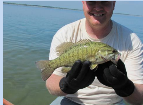
*Webster 2013 smallmouth bass