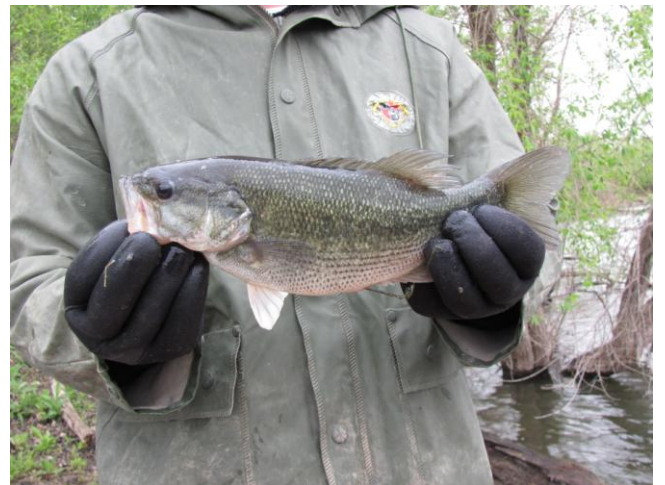
*Sebelius spotted bass

The largemouth bass population is dominated by 11 to 15 inch fish accounting for 69 percent of the sample. Largemouth bass in the 7 to 11 inch size range accounted for 12 percent of the sample, fish in the 11 to 15 inch size range accounted for 69 percent and fish over 15 inches made up 19 percent. The biggest largemouth bass sampled weighted in at 3.39 pounds. Good numbers of spotted bass are also present with 6 percent being in the 6 to 9 inch size range, 23 percent being in the 9 to 11 inch size range, 45 percent being in the 11 to 13 inch size range and 26 percent being in the 13 to 16 inch size range. The biggest smallmouth bass sampled weighted in at 1.99 pounds. Spinner and artificial bait's should work well in Leota cove, along the dam, Shoen's cove and up the river channel by the sandpit. Fish the rocky areas for the spots. A 15 inch length limit on largemouth and spotted bass is in effect