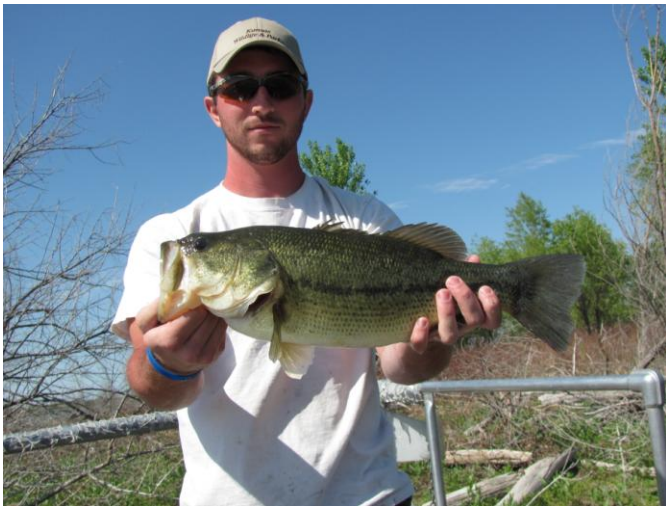
* Kirwin largemouth bass

The largemouth bass population is in a lot better shape than what the sampling results show. While sampling we had some equipment issues and after the equipment was fixed Mother Nature decided to turn on the gale force winds from the North and South. However, we did catch some fish but what was caught did not represent the population very well. Fish in the 12 to 14 inch size range accounted for 50 percent and fish over 15 inches accounted for 50 percent. The biggest largemouth sampled weighted 2.52 pounds. The best locations for finding bass are going to be along Crappie Point and back toward Scout cove, the cove by the North Shore and South Shore ramps and along the dam and outlet area. With the lower water levels the bass should be concentrated to the areas mentioned above. A 15 inch length limit is in effect.