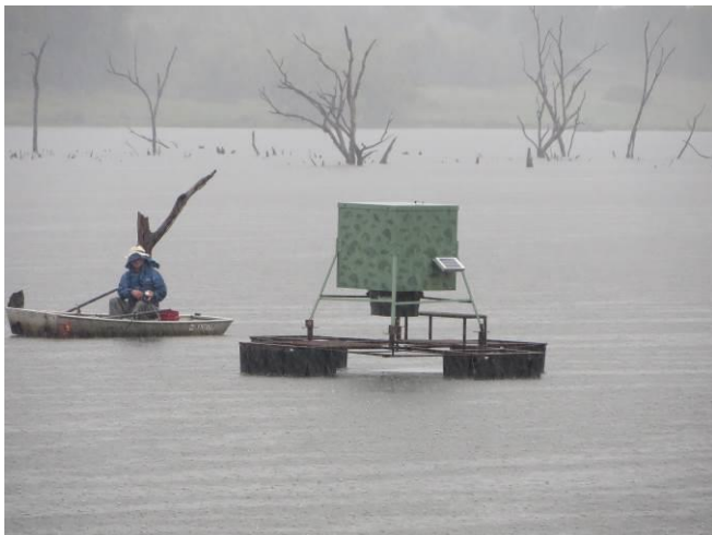
In addition to the Pittsburg and Thayer grants approved for fiscal year 2017, Public Wholesale Water Supply District No. 11 installed five new fish feeders on Bone Creek Lake this spring that they obtained through a CFAP grant last year.

The CFAP grant program is made available to nearly 240 community lakes statewide for development projects that benefit anglers and boaters. Cooperators are required to pay a minimum of 25 percent of development costs. Applications for these funds is competitive and is based on needs and benefits of the project, participation in CFAP, and the amount contributed toward the project by the applicant. Approximately $225,000 is available statewide annually.