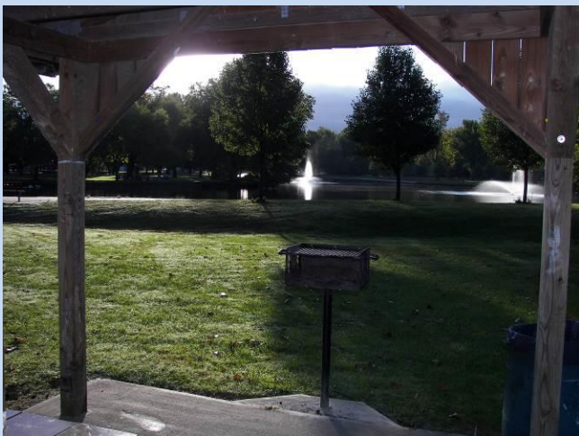
Lakeside Park is a favorite fishing spot for kids and their families. Two fishing derbies and several fishing clinics for schools are held at the lake every year.

The $29,300 project will include construction of a 25-foot by 12-foot concrete fishing area located where the duck house, sidewalks and electrical box is now located. The dilapidated duck house and fence will be removed. A 30-foot by 30-foot parking area with an accessible parking stall and another stall for a maintenance vehicle will be built on the east side of the restroom building. A 225-foot by 6-foot sidewalk will lead from the parking area to the shoreline fishing area. The City will provide $11,670 (40 percent) of the total cost. Labor and the use of City equipment for the project will be used as a significant part of the City's match.