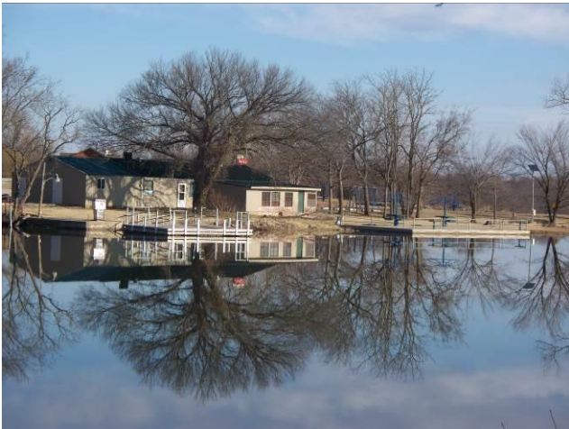
Crawford State Fishing Lake has a marina and several floating fishing docks for the shoreline angler.

Crawford State Fishing Lake - Largemouth bass numbers at Crawford State Fishing Lake (CRSFL) remain low. The May 12, 2016 bass electrofishing catch rate of only 29.4 stock fish/hour is relatively unchanged from the 28.8 fish/hour last year and the 27.9 fish/hour in 2014. Bass numbers at CRSFL have been very low since 2004. The initial cause of the bass density decline was verified as largemouth bass virus in June 2007. The mean stock catch rate from 2005-2015 is only 30.8 fish/hour. In contrast, the highest catch rate ever recorded was 118.8 fish/hour in 2002. It was hoped that largemouth numbers would steadily improve following the bass virus epidemic, but they have failed to increase to the 50-75 stock fish/hour objective. Spotted bass are also common at CRSFL, and the 2016 stock catch of 16.2 spotted bass/hour raises the total black bass catch rate to 45.6 fish/hour. The quality of the largemouth fishery remains good. The percentage of quality-size fish (12-inch-plus) remained very high in 2016, as 80 percent of the catch fell into this group. The population continues to have a very high percentage of preferred-size (15-inch-plus) fish, as 36.7 percent of the stock catch were preferred-size fish. Body condition of all size groups was very good.