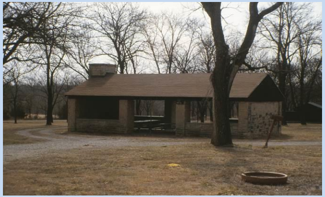
Neosho State Lake is a family friendly lake with good shoreline access, nice picnic and primitive camp sites, and even a shelter house.

Neosho State Fishing Lake - A total of 172 bass were collected by electro-fishing in the May 26, 2016 sampling. The catch rate for stock-size fish (8-inch-plus) increased slightly to 110 fish/hour. This is near the lake management objective to maintain the catch rate near 100 stock-size fish/hour. The mean stock catch rate in the four previous years (2012-2015) is 102 fish/hour. Maintaining a substantial bass population is imperative to exert the predation necessary to control abundant shad and sunfish populations at Neosho