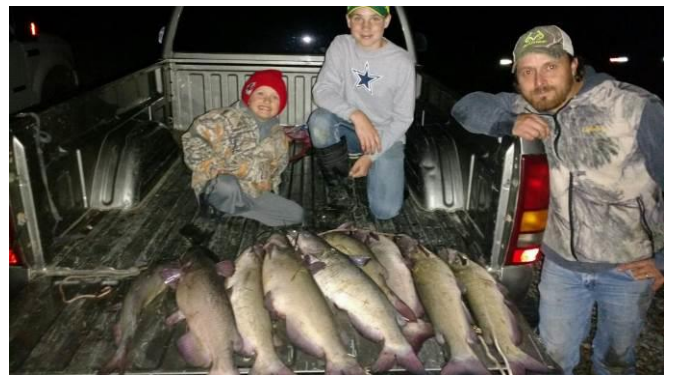
These lucky anglers display their impressive catch of trophy channel catfish caught from Unit No. 11 several days after the weekend opener. I'll bet this fishing trip was one these youngsters won't soon forget.

In addition to the physical improvements, a channel catfish feeding program was implemented from May through September each year during the closure. As seen in the photo below, the feeding program resulted in some impressive results. Strip-mined lakes are capable of producing some big catfish. The current 36-pound state record channel catfish was caught from a public Mined Land Wildlife Area lake.