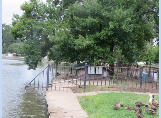
An additional benefit of the Lakeside Park project is the dilapidated duck house, broken concrete and unsightly fence will be removed. Hopefully problems created by too many ducks and geese will improve.