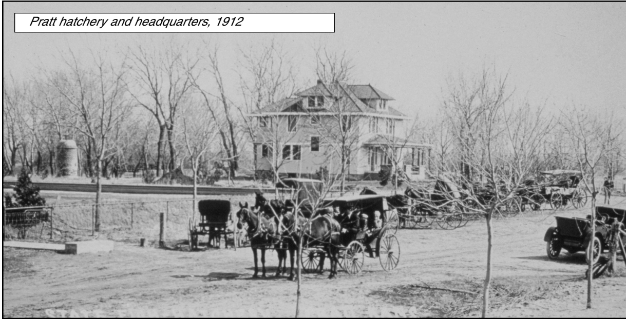
Pratt hatchery and headquarters, 1912