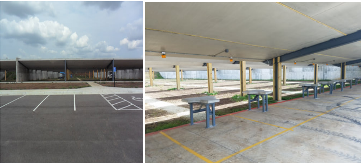
New range facilities at El Dorado State Park will soon provide area hunters and shooting sports enthusiasts with quality recreation opportunities.

Please remember that target practice is not allowed on the El Dorado Wildlife Area. Agency regulation (115-8-1), allows target practice only in areas designated as open for target practice. The El Dorado Lake Shooting Range is the only area designated for firearm target practice on public lands at El Dorado Lake. An existing archery range, also within El Dorado State Park, is the designated area for archery target practice. Both facilities will soon provide quality shooting opportunities for area hunters and shooting sports enthusiasts.