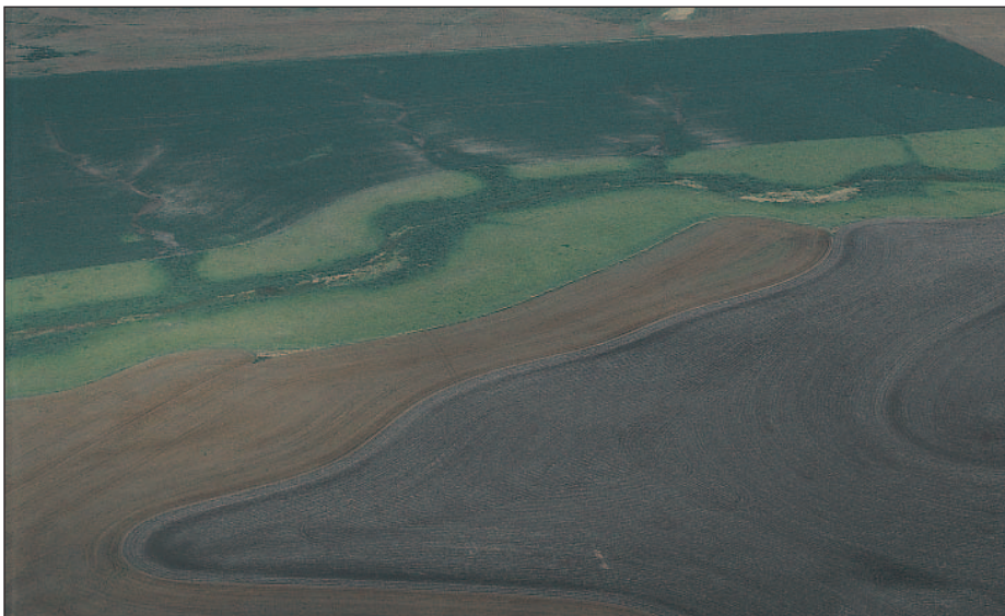
A filter strip helps keep sediment and farm chemicals out of this small stream.

When it comes to grassed terraces, another CCRP catch phrase, "Farm the Best and Buffer the Rest," clearly applies. In many cases, terrace construction has excavated less productive subsoils that now comprise much of the terrace ridge. Consider also that rains run off terrace ridges, snow blows off them, and their elevation exposes them to desiccating winds during the growing season. Particularly where moisture is limited, these factors