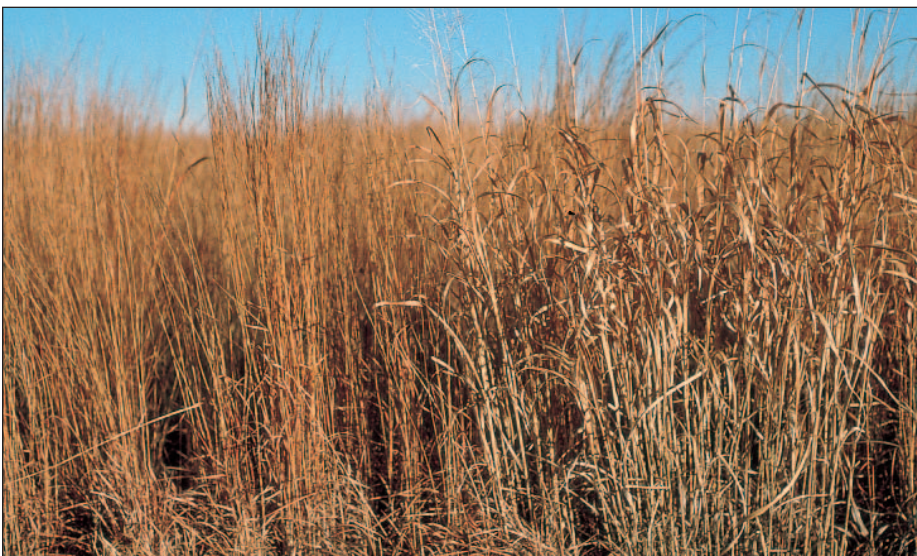
Little bluestem (left) and switchgrass (right) stand up well through wind-driven rain or snow, making the grasses ideal for buffers and for wildlife habitat.

Consider the October 1997 blizzard that hit western Kansas. That storm dumped up to 2 feet of snow with 60 mph winds. Of course, snow blew off most croplands and huge drifts accumulated behind any kind of barrier. The storm caused serious losses of livestock in feedlots, much of which came after the blizzard. As the drifts melted, livestock were wading around in cold mud for months. The resulting stress, added to earlier losses, reduced weight gains, and caused further economic hardship. If the fields around those feedlots had been treated with grassed terraces or grass wind strips, chances are that much less snow would have blown into stock pens, cutting losses significantly. And snow kept on crop