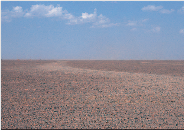
Lighter soils, often seen in terrace ridges, are less productive for crops but offer ideal sites for grass buffers.

mean terrace ridges may yield less, so farming them may be unprofitable. In most cases, terrace ridges would yield more benefits and profit as CCRP grass strips.