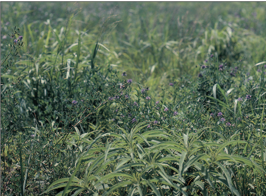
Adding broad-leaved forbs to the seed mixture will greatly improve the buffer's habitat quality. Here alfalfa and Maximilian sunflower diversify the stand.

Other potential benefits of buffers are on the horizon. Since the native grasses used in buffers take carbon dioxide (CO 2 ) from the air and hold the carbon in their deep root systems, buffers can help in the effort to slow the effects of global warming. Farmers and landowners may soon be able to receive direct, private-sector payments for seeding and maintaining grasses through the process of selling "carbon credits" on the open market. Buffers may also prove critical in minimizing the effects of severe weather extremes predicted to accompany global warming. Researchers are even interested in studying the possibility that native grass buffers could act as barriers to some crop diseases. It is known is that diverse ecosystems, particularly diverse agricultural ecosystems, are more