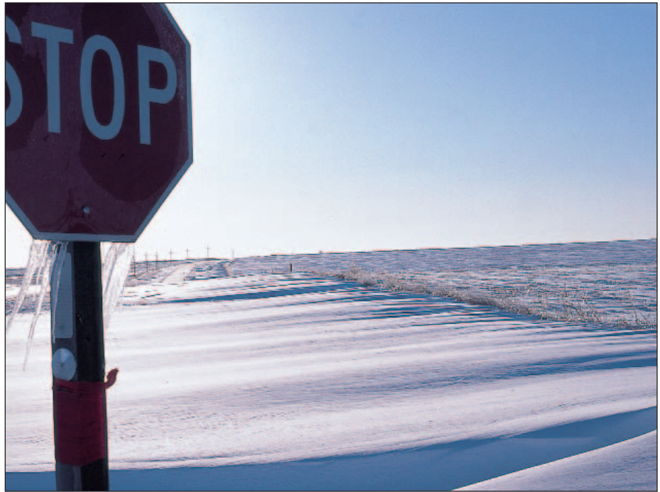
Buffers could have stopped this snow on the field where it would have provided valuable soil moisture; instead, it's just causing problems.

grassed terraces reduce sediment, nutrients, and pesticides in field runoff. Establishing stiff-stemmed grasses on terrace ridges creates a windbreak that slows the wind and prevents it from stealing topsoil. Slowing the wind leads to many other benefits, including keeping snow on the field where this important