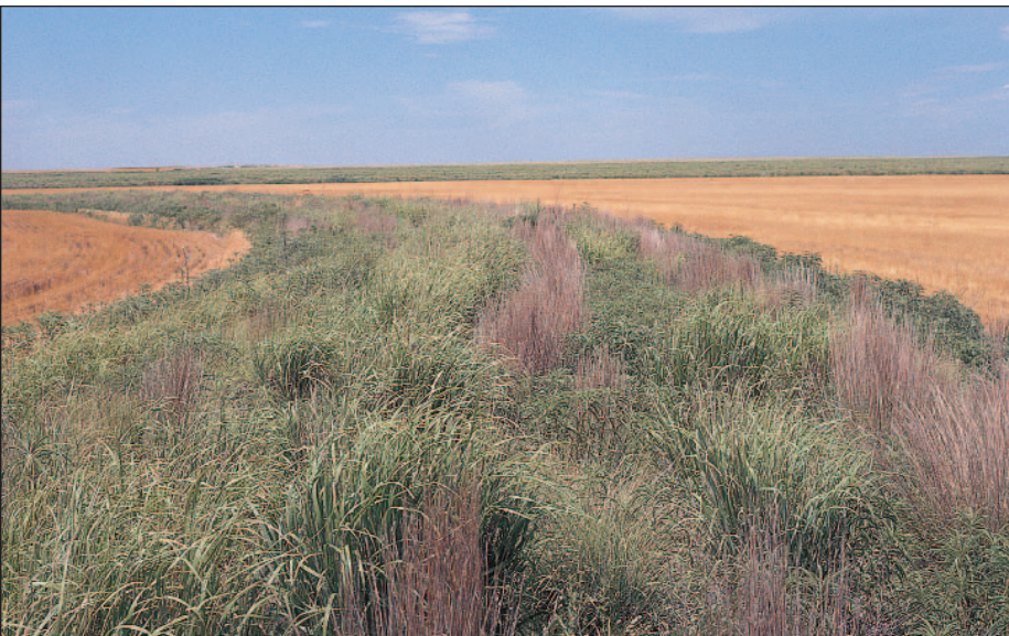
Pheasants poured out of this Scott County cross wind trap strip shortly after this photo was taken. Contour grass strips can be seeded on terraces or on unterraced land